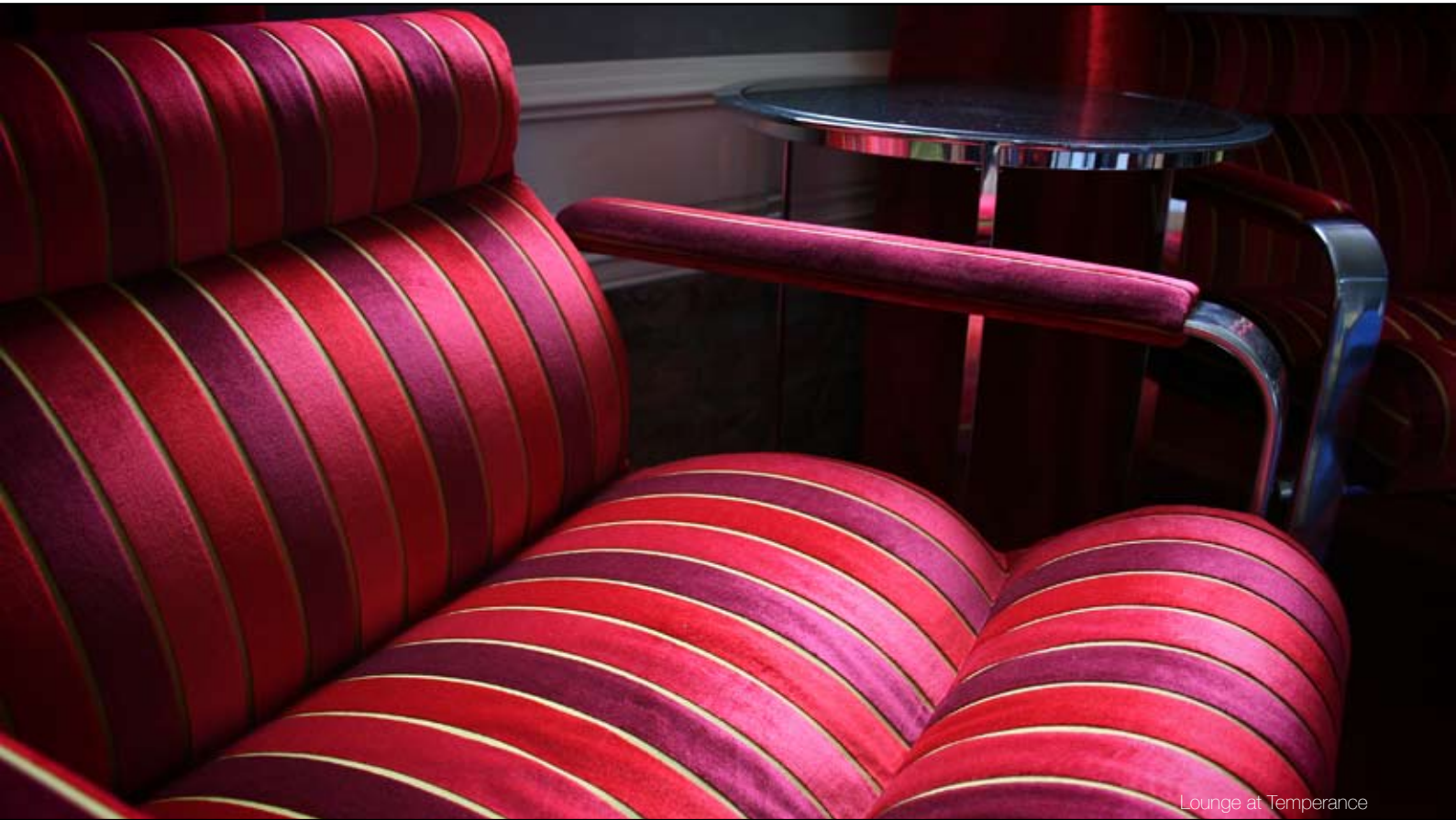
Lounge at Temperance